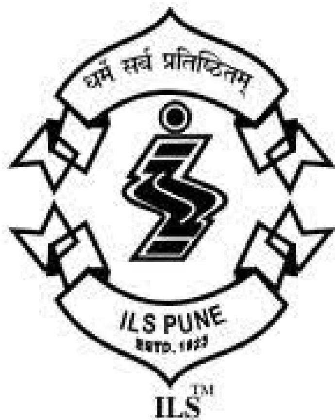
ILS Law College, Pune